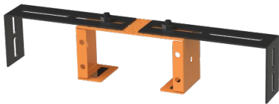
PLO-U-MMPED-KIT and PLO-ORU-UMC-2LGX