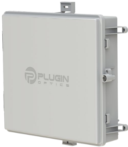
PLO-UBE-4LGX-0000-01 Single Compartment Enclosure

Universal Building Enclosures (UBE's) are LGX based and available in a single compartment, for use with connectorized common or feeder cables, and a dual compartment for "splice in" applications and additional slack storage. The front compartment is used to house LGX WDM modules, LGX PLC Splitters and 12 and 24-fiber bulkhead connectors. The rear compartment provides fiber slack storage and a 24-fiber splice tray for mass or single fiber splicing.