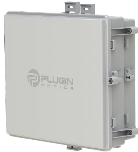
PLO-UBE-4LGX-SPAS-02 Dual Compartment Enclosure