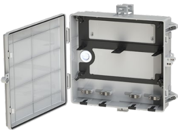
Enclosure shown without LGX or UBM solutions installed.