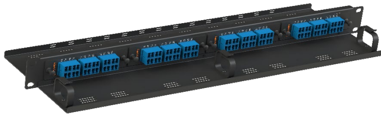
23-INCH FDP PANEL EQUIPPED WITH FOUR, 24-PORT LC UPC BULKHEAD FACEPLATE MODULES

NOTE: LGX BASED FDP PANELS ARE COMPATIBLE WITH MOST LGX BASED MODULES INCLUDING CWDM/DWDM, BULKHEAD MODULES, PIGTAIL MODULES, SPLICE IN MODULES, AND SPLITTER SOLUTIONS.