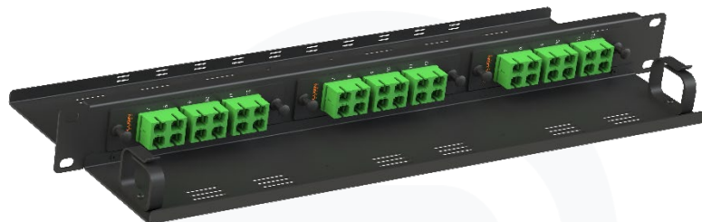
19-INCH FDP PANEL EQUIPPED WITH THREE, 12-PORT LC UPC BULKHEAD FACEPLATE MODULES